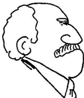
SECOND CHAIR TROMBONE

OLDEST MEMBER OF THE ORCHESTRA, HAS SEEN EVERYONE COME AND GO, HAS TOTAL RETENTION FOR EM- BARRASING INCIDENTS, OFTEN FORGETS MOUTHPIECE AND HAS TO PRETEND TO PLAY,