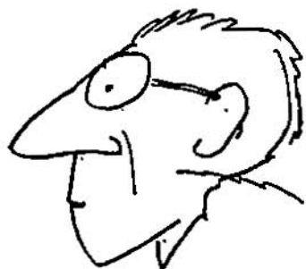
ASSISTANT FIRST CHAIR TROMBONE

FATHER FIGURE, RESPONSIBLE, HAS SENIORITY, IS A GOOD FRIEND OF THE CONCERT MASTER, LIVES IN THE SUBURBS,