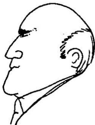
FIRST CHAIR (SOLO) TROMBONE

FATHER FIGURE, RESPONSIBLE, HAS SENIORITY, IS A GOOD FRIEND OF THE CONCERT MASTER, LIVES IN THE SUBURBS,