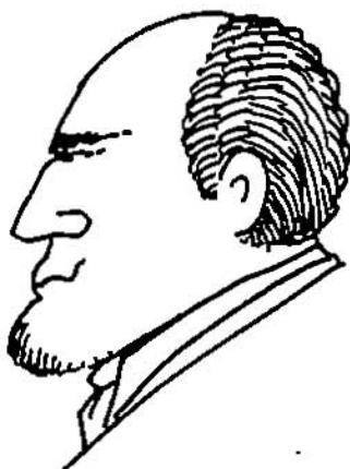
THIRD CHAIR (BASS) TROMBONE

OLDEST MEMBER OF THE ORCHESTRA, HAS SEEN EVERYONE COME AND GO, HAS TOTAL RETENTION FOR EM- BARRASING INCIDENTS, OFTEN FORGETS MOUTHPIECE AND HAS TO PRETEND TO PLAY,